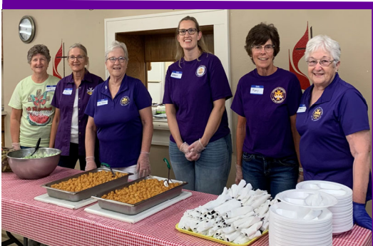
Members from Ct. St. Patrick #1699, Kimball and Ct. Madonna #1952, Plankinton, shared their time and resources when they served at the Love Feast in Mitchell

MISSION STATEMENT Catholic Daughters of the Americas® strives to embrace the principle of faith working through love in the promotion of justice, equality and the advancement of human rights and human dignity for all.