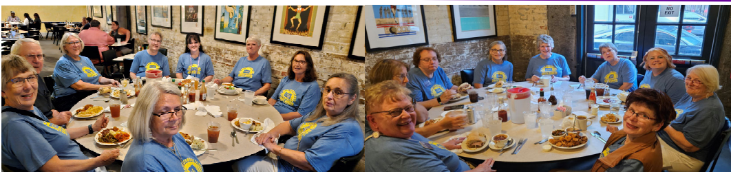
State Night at National Convention— TWO tables full of South Dakota spirit!